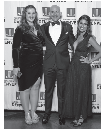
Attendees enjoying The Journey 2024